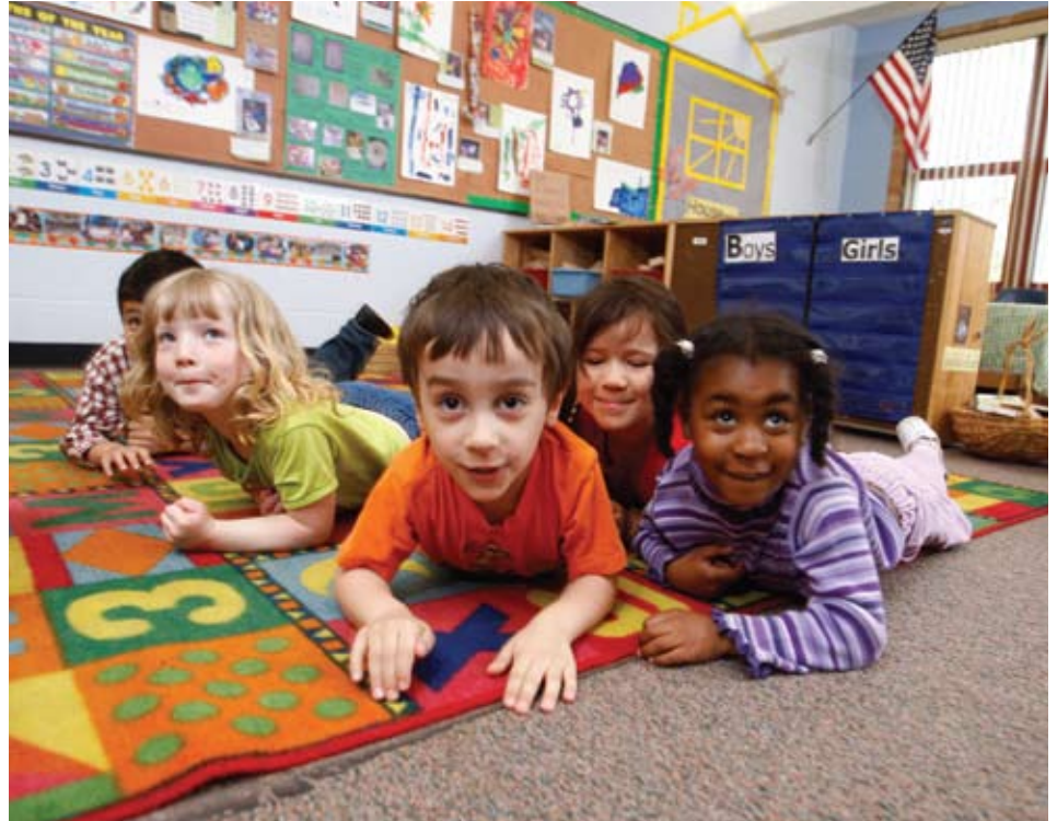
A Head Start classroom at Elsie Rogers in Mishawaka, one of the many that the Community Foundation's Early Years Count Education initiative has helped to turn into a rich, child-centered learning environment.