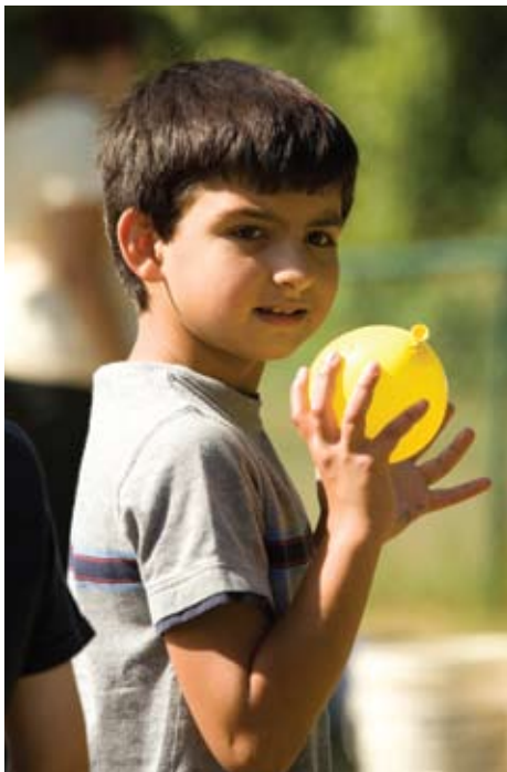
LOGAN serves hundreds of children and adults in our community with disabilities.

For LOGAN, an unexpected bequest brought some good news that will continue to make a difference long into the future.