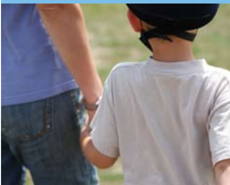
A teacher and student with Reins of Life, a local nonprofit therapeutic horseback riding program that has an endowed agency fund with the Community Foundation.

With initiatives that focus on strengthening early childhood education, helping our elderly citizens stay in their homes longer, creating opportunities for African Americans, building our community's arts and culture resources, and supporting our local parks, the Community Foundation enriches life in St. Joseph County for every one of us—permanently. Learn more about what we do here at the Community Foundation and how you can become a part of building the future of our St. Joseph County at www.cfsjc.org .