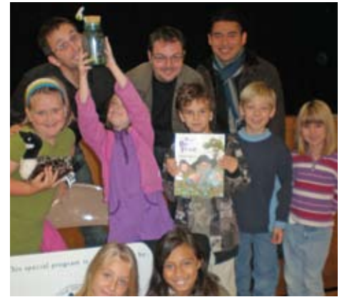
Members of the Euclid Quartet pose with Twin Branch Elementary School students who have been participating in the Fischhoff National Chamber Music Association's Artist Residency.

George Rickey Estate/George Rickey Foundation , and 1st Source Bank , the Community Foundation supported a range of Rickey events, including the installation of five large, shimmering stainless steel Rickey sculptures in downtown South Bend, in place through September 2010. Other Rickey-related programs include the development of curriculum materials that incorporate Rickey's work, self-guided walking tours for families that investigate the math and science of Rickey's sculptures, kinetic sculpture awards for students, and more—all of which you can learn about at ArtsEverywhere.com .