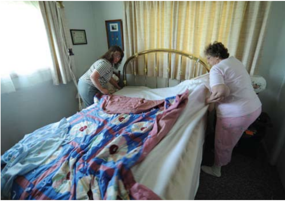
REAL Services volunteers work with our community's elderly to improve their day-to-day quality of life.