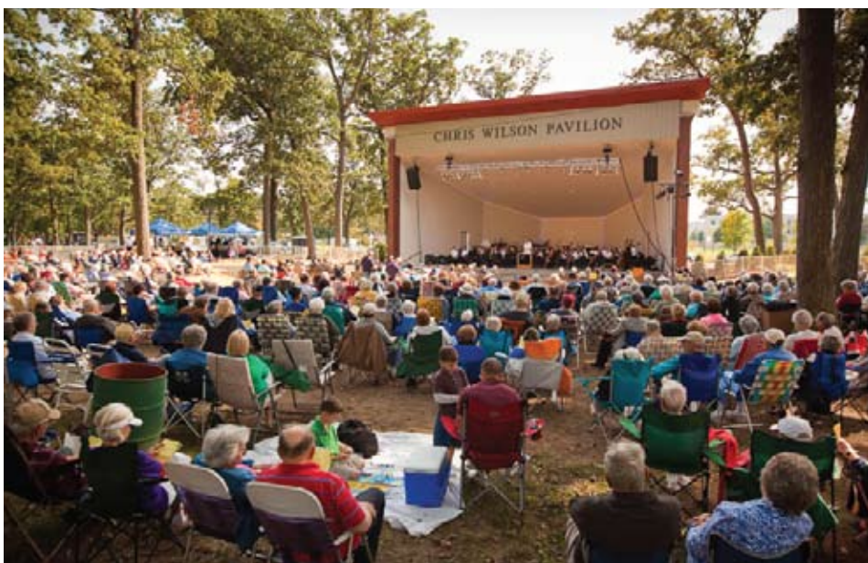
The South Bend Symphony Orchestra performs at the dedication of the new Chris Wilson Pavilion.